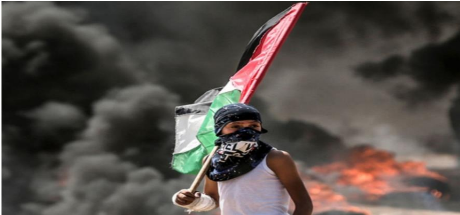
Image 2 : A Palestinian boy holding his national flag looks at clashes with Israeli security forces.

The shot distance is close and personal to create intimacy with viewers though both are not looking directly at them. The angle is low to assign them more power before the viewers. Netanyahu and Trump have the left and the right positions respectively; Trump receives more attention as he is the supporter of Israel and the sponsor of the US embassy move. Trump and Netanyahu's facial expressions and their body language are identical in a strange way and this results in having salience or foregrounding; meetings of presidents are known to be more formal, like being not so close while standing or sitting next to each other.