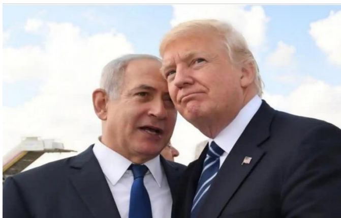
Image 1 : Israel's PM, Benjamin Netanyahu, with Donald Trump at Ben Gurion international airport in Tel Aviv on 23 May

Next, images associated with the headlines being previously analyzed were examined with a detailed focus on Trump , if present , since he is the one who issued the decision of the US embassy move . The aim behind this visual analysis is to find out whether Arab and American English newspapers employ similar visual strategies in reporting the move of the US Embassy to Jerusalem.