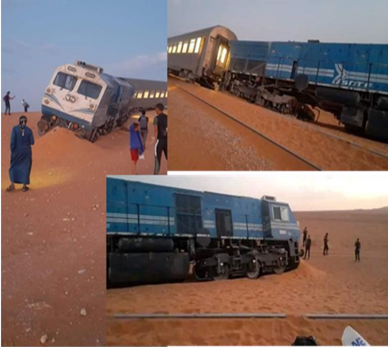
Fig.2. Train Accidents and Derailments Due to Sand August 2024.

encroachment, which spans from kilometer point 170 in the Rasfa area to kilometer point 115 in the Huita and Rasfa areas, located in the Biyoud municipality in Naama province.