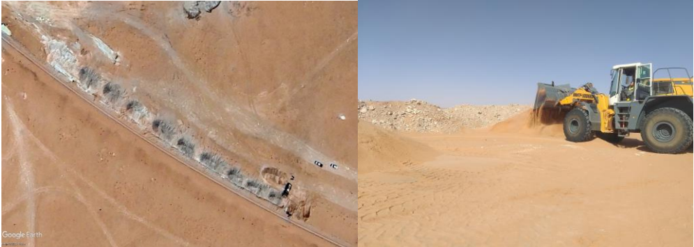
Fig.5. The process of completing the arm in August 2023, source: own study

Preliminary results are very satisfactory in a route that experienced train derailments due to sand.