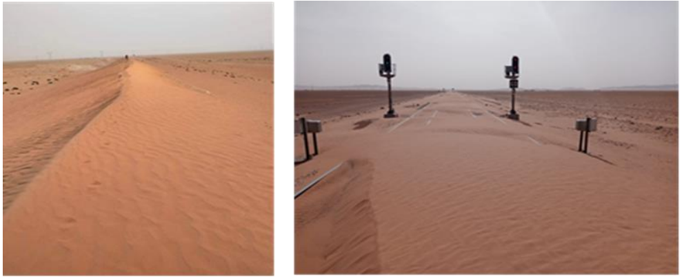
Fig.3. Sand blocked railway.

Through the visits, it became clear to us that the soil is suffering from erosion due to wind erosion, as a result of many years of continuous drought, leading to land degradation. Furthermore, the area is severely affected by desertification and is in an advanced stage of it. These factors have created a suitable environment for sand encroachment by the prevailing winds. However, after a careful analysis of the sand grains, it is evident that they originate from a distant source (outside the Naama province, originating from Morocco). It is important to note that there are two significant directions of the prevailing winds: the strong winds coming from the southwest and the winds coming from the north. The elevation of the railway itself forms a major obstacle to the movement of the sand, making it the primary reason for the accumulation of sand along the railway.